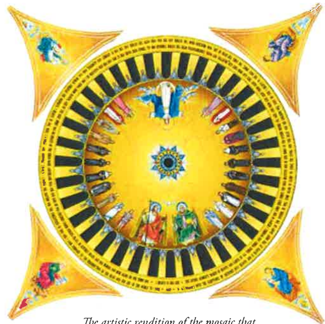
The artistic rendition of the mosaic that will adorn the Trinity Dome.

The Trinity Dome is the central and largest dome of the Basilica. This "Crowning Jewel" will be adorned in mosaic and will depict the Most Holy Trinity, the Blessed Virgin Mary as the Immaculate Conception, and a procession of saints who have an association with America and the Basilica. The Nicene Creed will encircle the base of the dome, while the dome's pendentives will feature the four evangelists: Matthew, Mark, Luke and John. The Trinity Dome will complete the work of the Great Upper Church according to its original iconographic scheme and bring to a close construction of the Basilica of the National Shrine of the Immaculate Conception as it approaches its centennial milestone in 2020.