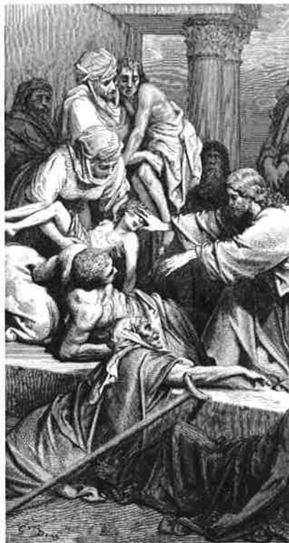
JESUS HEALING THE SICK, GUSTAV DORE, 19TH CENTURY

It's not easy to deal with significant health problems. Our faith can help us. We can draw strength through the sacrament of the Anointing of the Sick, by wearing a medal of the Archangel