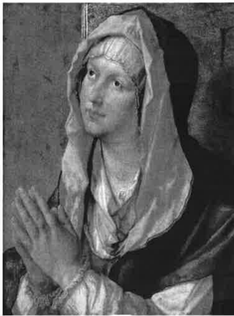
THE VIRGIN MARY IN PRAYER, ALBRECHT DÜRER (1518)

TODAY'S READINGS: Acts 7:55-60; Revelation 22:12-14, 16-17, 20; John 17:20-26 (61) . "The world may know that you sent me, and that you loved them even as you loved me."