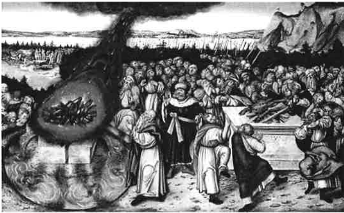
ELIJAH AND THE PRIESTS OF BAAL, LUCAS CRANACH THE YOUNGER (CA. 1545)