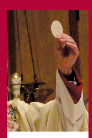
The Year of Faith "will also be a good opportunity to intensify the celebration of the faith in the liturgy, especially in the Eucharist."